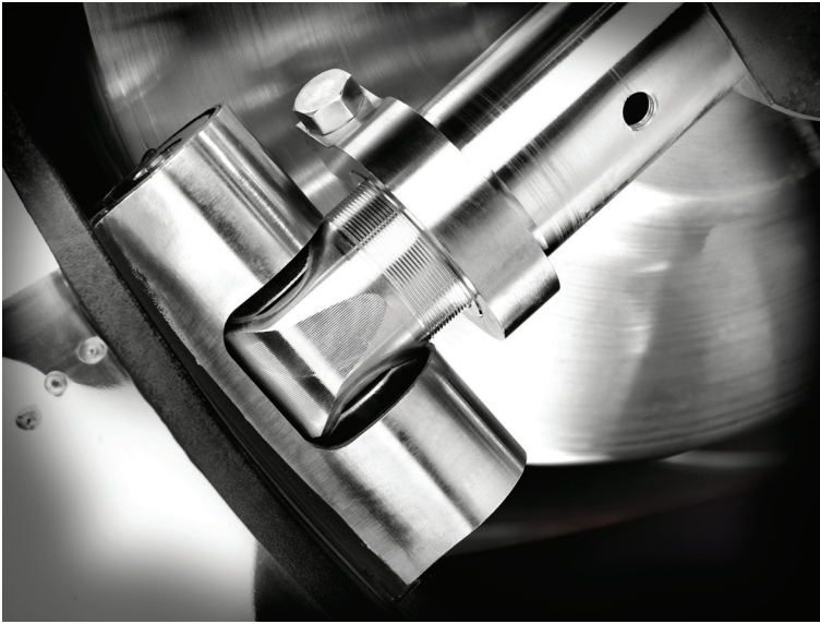
Fan blades are resiliently mounted to machined aluminum hub.