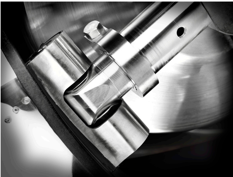
Fan blades are resiliently mounted to machined aluminum hub.